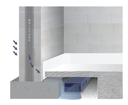
AFTER OPTION I COVER WEEP HOLES ONLY